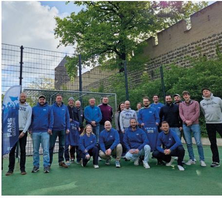
Team FANS WELCOME

FANS WELCOME would not be possible withour our local fan projects. Football is their everyday work. The management of the points of contact is therefore in their experienced hands. You can rely on them to support you with any concerns. In addition to assistance, you will receive information about the EURO, the host cities, fan cultures, and event tips. Or you can engage in exchange with fans from different nations and the residents of the host cities.